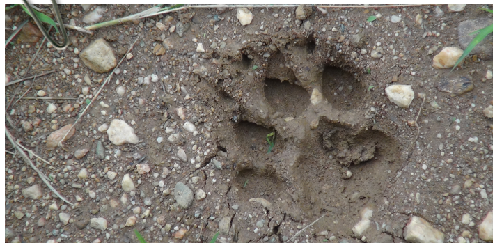
A LION PAW PRINT IN THE DIRT AS THE LIONS HAVE A FEAST