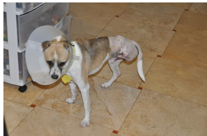
THIS DOGS LEG WAS AMPUTATED