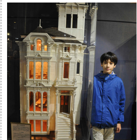
A DOLLHOUSE IN TAIWAN